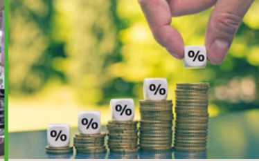
Pet food ingredients Coronavirus drives up prices