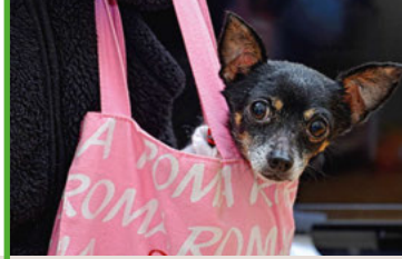
Italy More than 60 mio pets