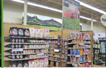
Dog food Natural products on the rise